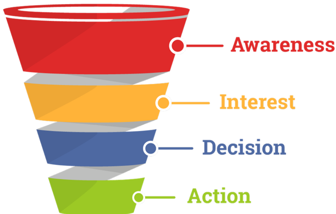
Figure 3.2: Decision Funnel

While the above diagram may seem overly simplistic, each of the stages will be explored in the sourcing process based on the experience of those in our community who have engaged extensively with the support of these services on behalf of their constituency.